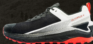
ALTRA OLYMPUS 4.0