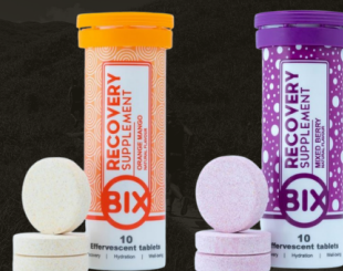
BIX RECOVERY HYDRATION TABLETS